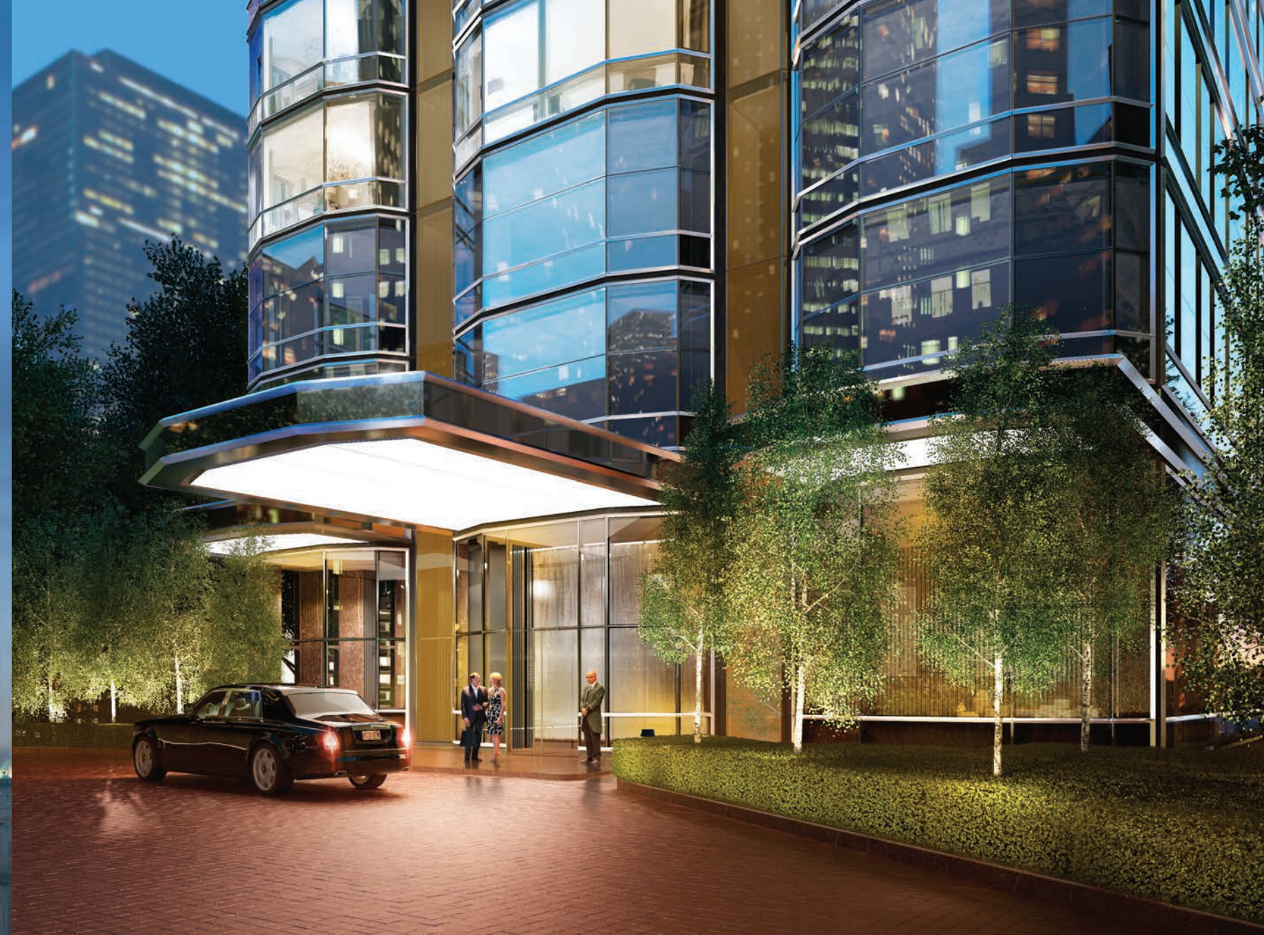
THE GATED MOTOR COURT WITH RESIDENTS-ONLY PARKING

Designed by celebrated global architects Foster + Partners and delivered by New York's legendary Zeckendorf Development and Global Holdings, 50 United Nations Plaza presents a unique opportunity for the discerning buyer – to live in one of Manhattan's most prestigious buildings in a style beyond compare. From its shimmering exterior of glass, burnished gold and stainless steel to the oasis-like calm of its grand entrance, every level of the striking modern tower conveys quality without compromise.