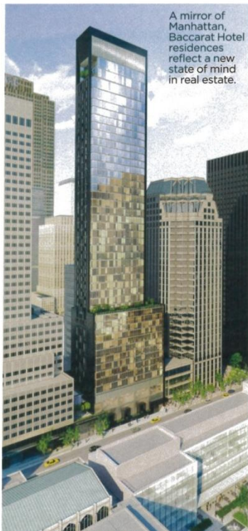
A mirror of Manhattan, Baccarat Hotel residences reflect a new state of mind in real estate.

Just across First Avenue from the United Nations Secretariat Building yet another luxury tower is